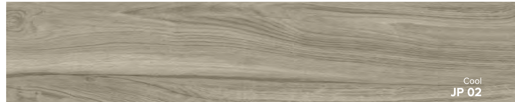
Cool JP 02