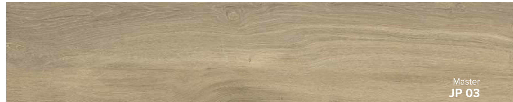
Master JP 03