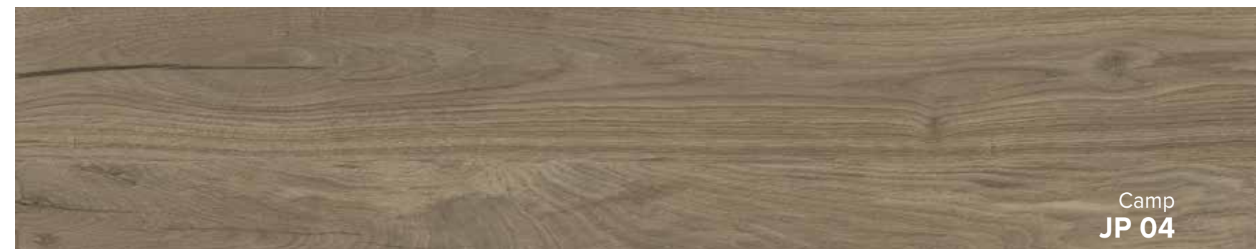
Camp JP 04