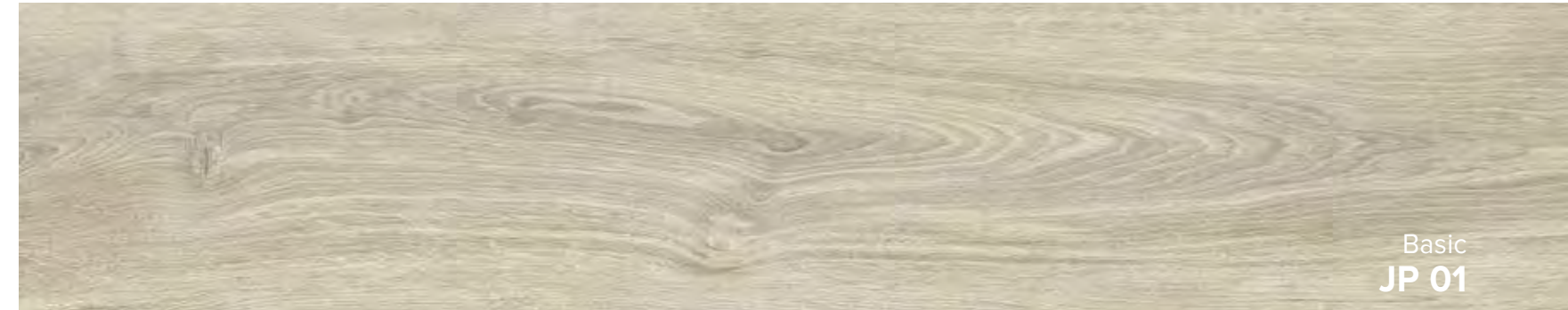
Basic JP 01

Colours | Farben | Couleurs | Colores | Цветов | 种颜色