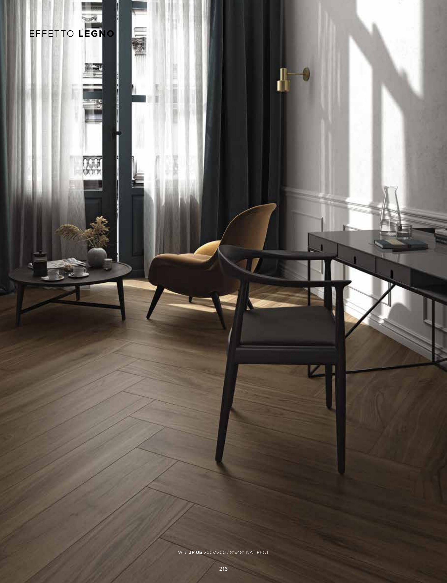
Wild JP 05 200x1200 / 8"x48" NAT RECT