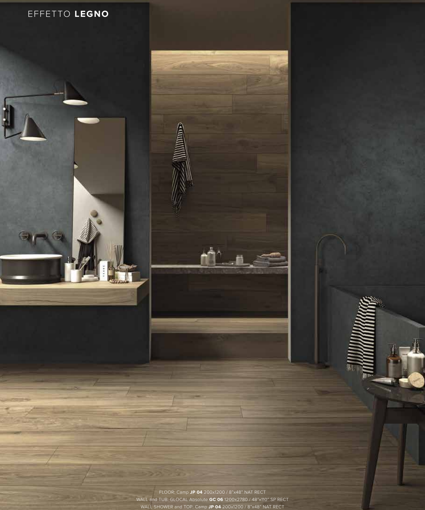
FLOOR: Camp JP 04 200x1200 / 8"x48" NAT RECT WALL and TUB: GLOCAL Absolute GC 06 1200x2780 / 48"x110" SP RECT WALL SHOWER and TOP: Camp JP 04 200x1200 / 8"x48" NAT RECT