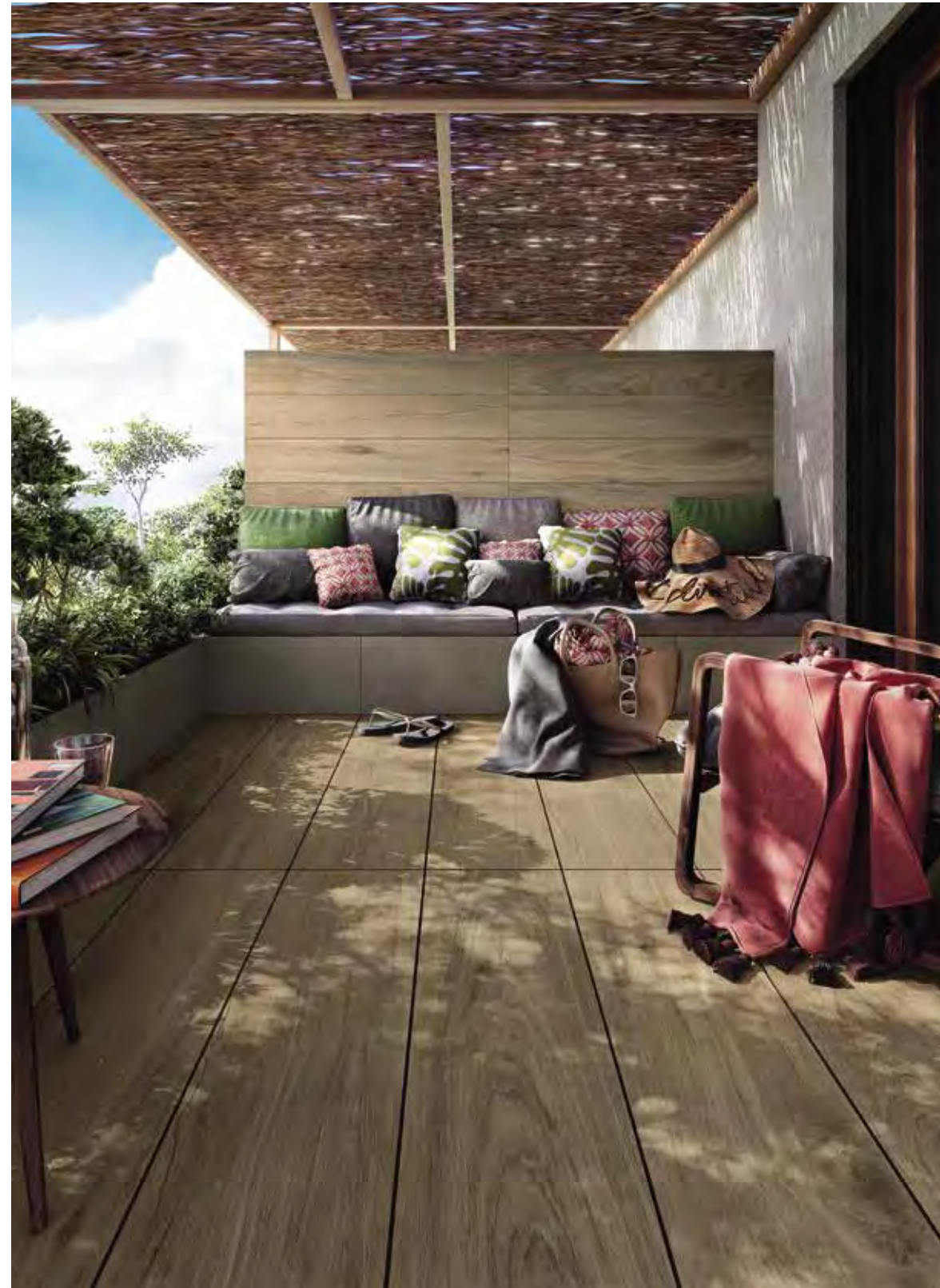
FLOOR: Camp JP 04 300x1200 / 12"x48" RD RECT EVO_2/E" \pm 20 mm WALL: Camp JP 04 200x1200 / 8"x48" NAT RECT