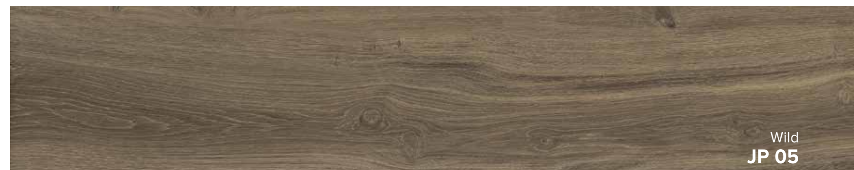
Wild JP 05