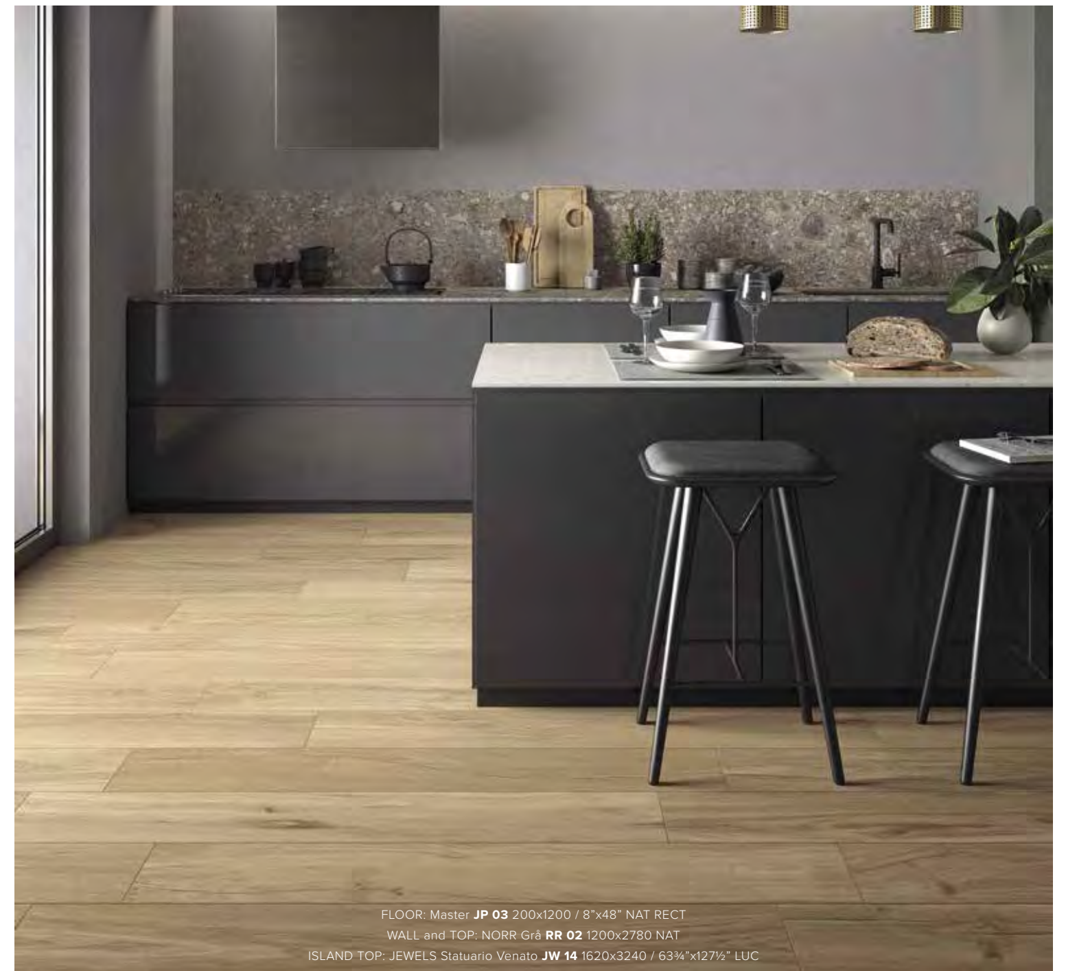
FLOOR: Master JP 03 200x1200 / 8"x48" NAT RECT

Jurupa comes in 5 colours, 3 sizes, Natural R9 finish for indoors, Grip R11 and Radiale R11 for outdoors, guaranteeing maximum coordinability within the collection.