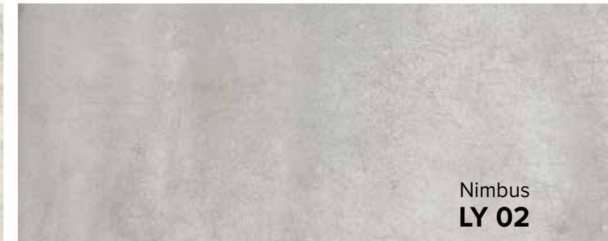
Nimbus LY 02