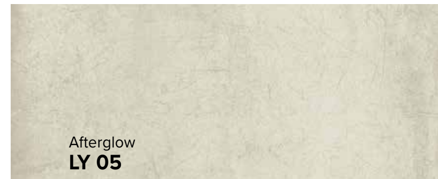
Afterglow LY 05