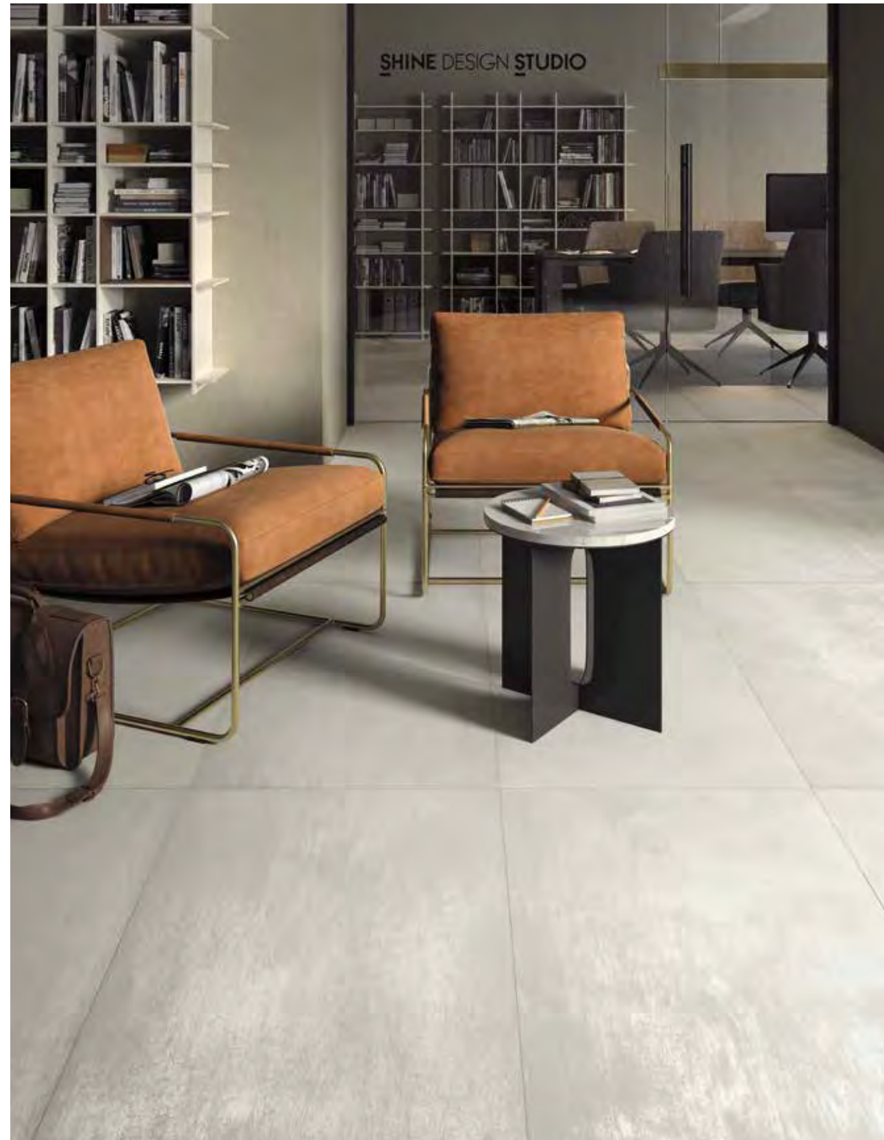
FLOOR: Palladium LY 01 600x1200 / 24"x48" SP RECT