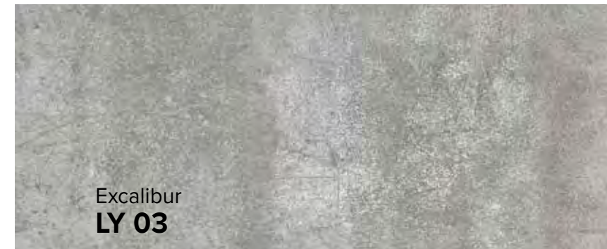
Excalibur LY 03