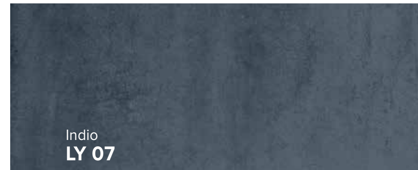
Indio LY 07