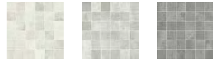
PALLADIUM LY 01 NIMBUS LY 02 EXCALIBUR LY 03

Mosaico 36T SP 300x300 / 12"x12" Tessere 48x48 / 2"x2"