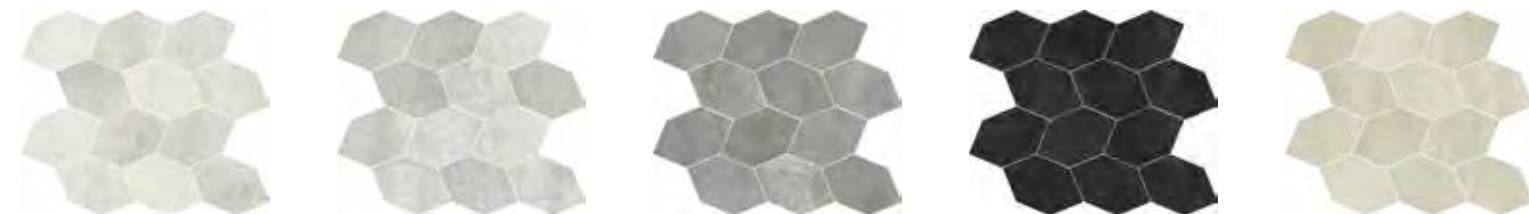
PALLADIUM LY 01 NIMBUS LY 02 EXCALIBUR LY 03 VENOM LY 04 AFTERGLOW LY 05