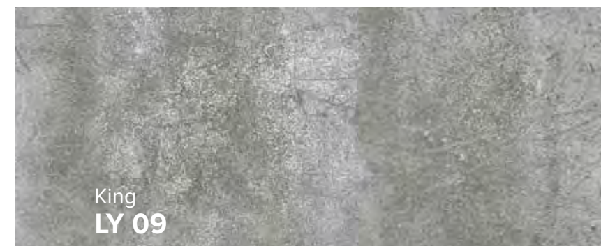
King LY 09