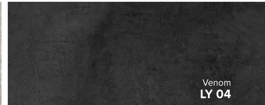
Venom LY 04