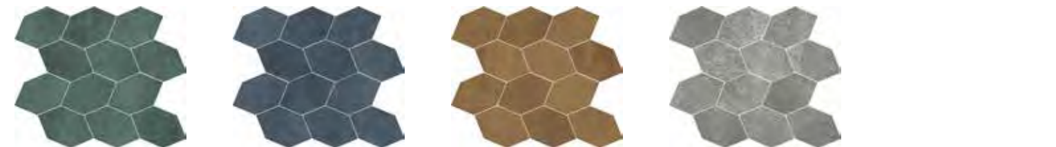
VIRIDIUM LY 06 INDIO LY 07 PUMPKIN LY 08 KING LY 09

MOSAICO 36T, FOLIAGE, PLUME: Decoro su rete | Mesh-backed decoration | Dekor auf netz | Décor sur filet | Decoración en red | Декор в сети | 网板背帖装饰件