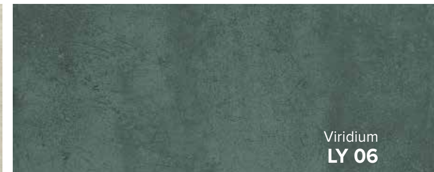
Viridium LY 06