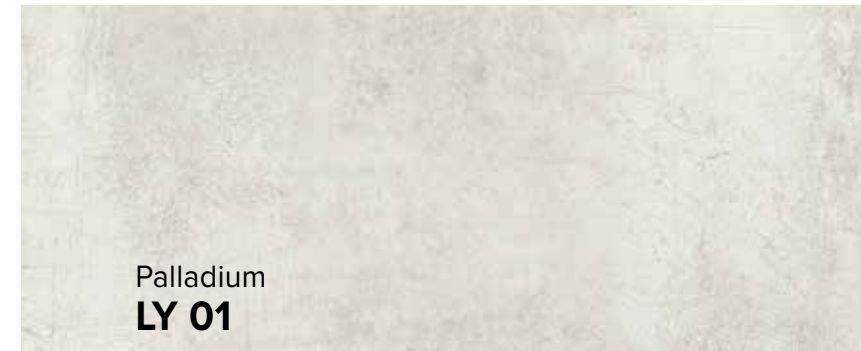
Palladium LY 01

Colours | Farben | Couleurs | Colores | Цветов | 种颜色