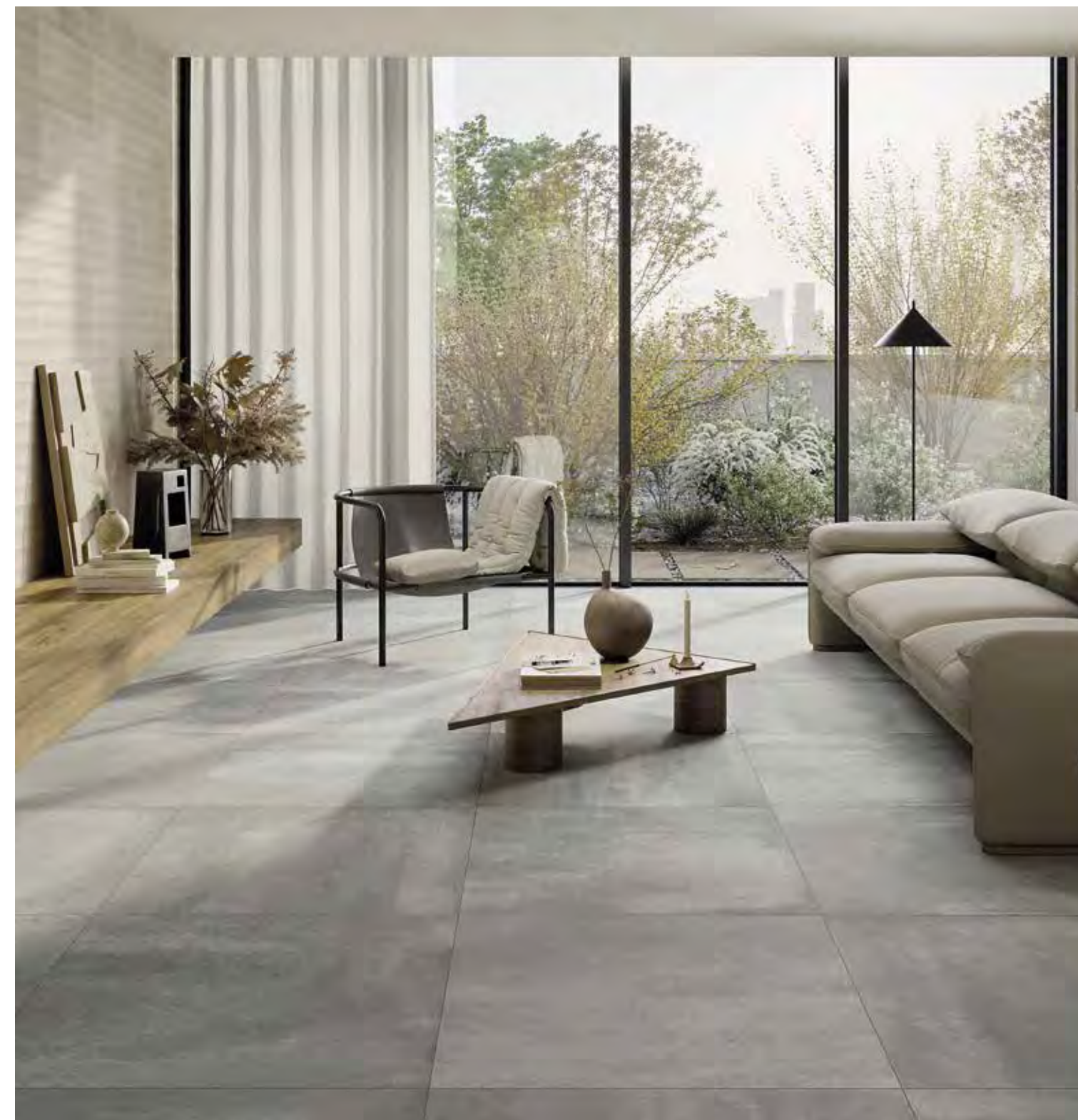
WALL: Bianco MD 01 300x450 / 12"x18" MELLOW FLOOR: Nimbus LY 02 800x800 / 31½"x31½" SP RECT