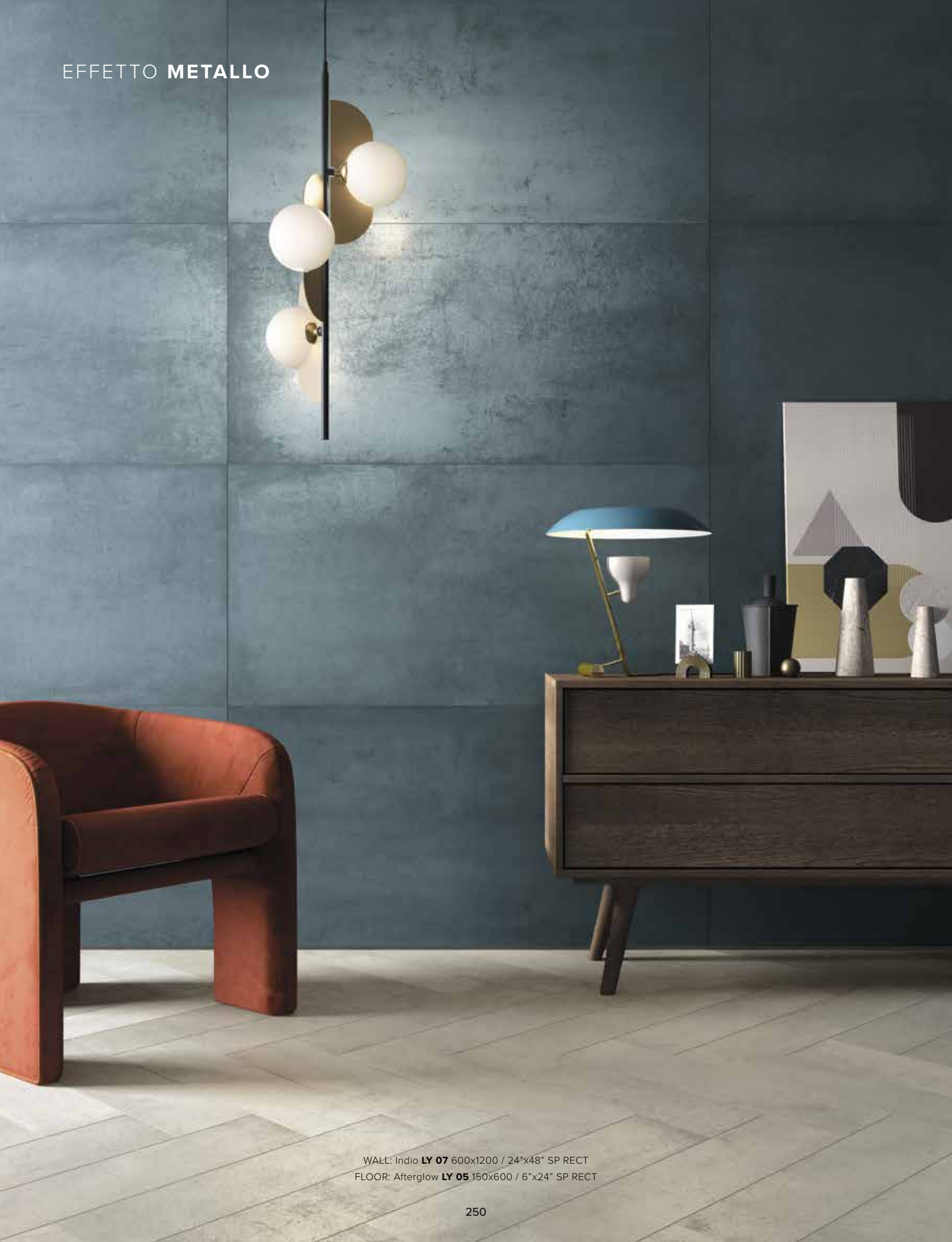
WALL: Indio LY 07 600x1200 / 24"x48" SP RECT FLOOR: Afterglow LY 05 150x600 / 6"x24" SP RECT