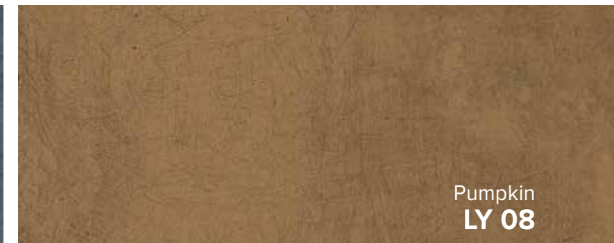
Pumpkin LY 08