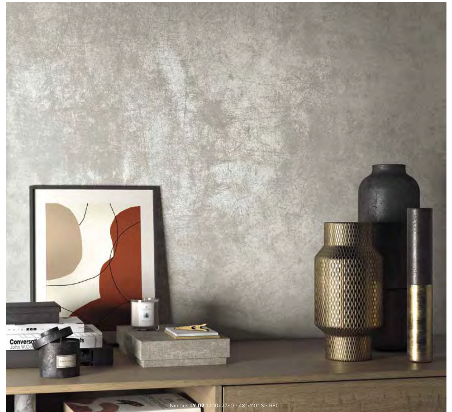
Nimbus LY 02 1200x2780 / 48"x110" SP RECT

Lemmy captures the most intimate emotion of metal at its most natural and authentic to bring an elegant, unconventional touch.