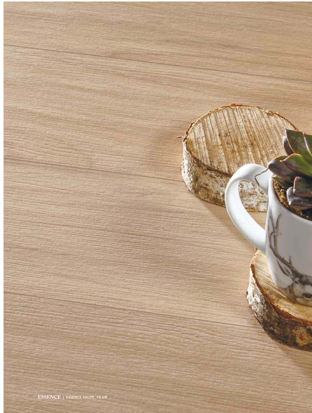
ESSENCE | ESSENCE TAUPE_19,5/R