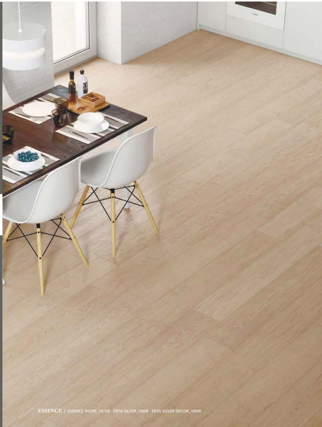
ESSENCE | ESSENCE TAUPE_19,5/R ERTA SILVER_100/R ERTA SILVER DECOR_100/R