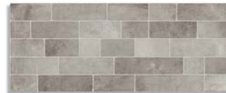
Marlon Gris G.145