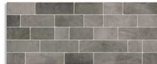
Marlon Grafito G.145