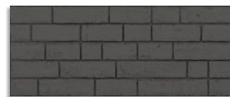
Edale Negro G.145