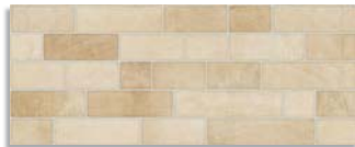
Marlon Beige G.145