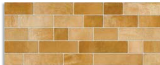
Marlon Natural G.145